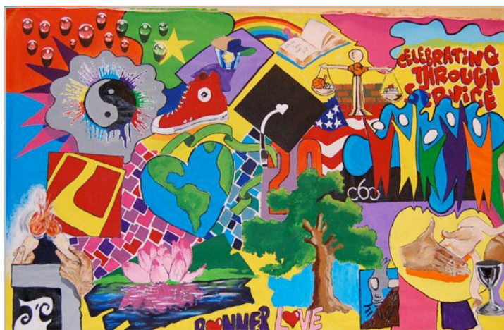
Bonner 20th Anniversary Mural, painted by Bonner staff and students from across the country at the Summer Leadership Institute at Berea College